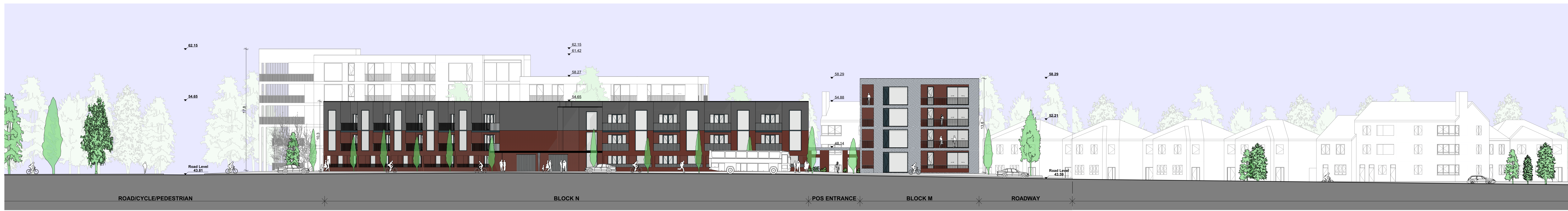
Site Section A-A SCALE 1:200