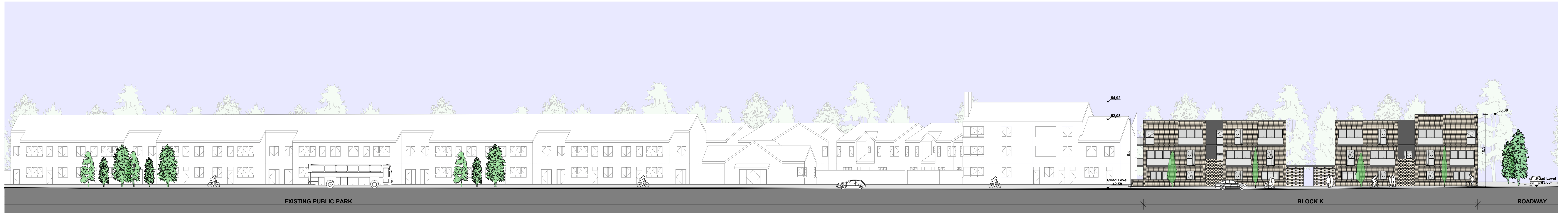
Site Section A-A (Continuation) SCALE 1:200