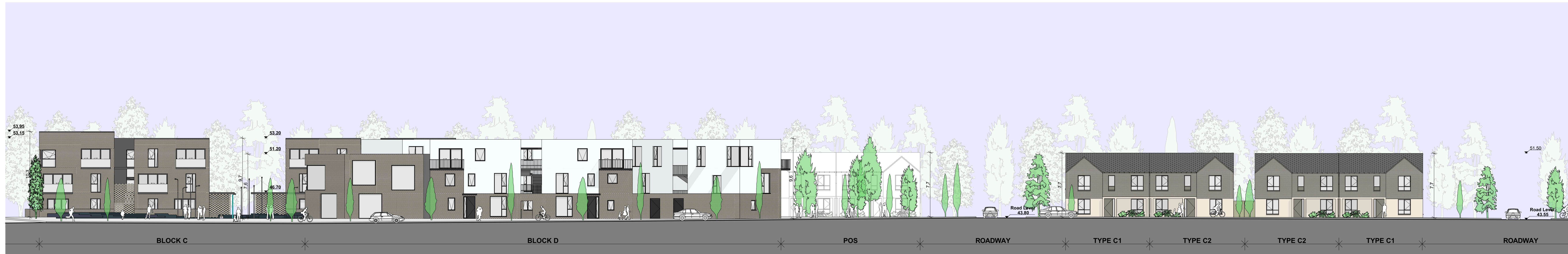
Site Section A-A (Continuation) SCALE 1:200