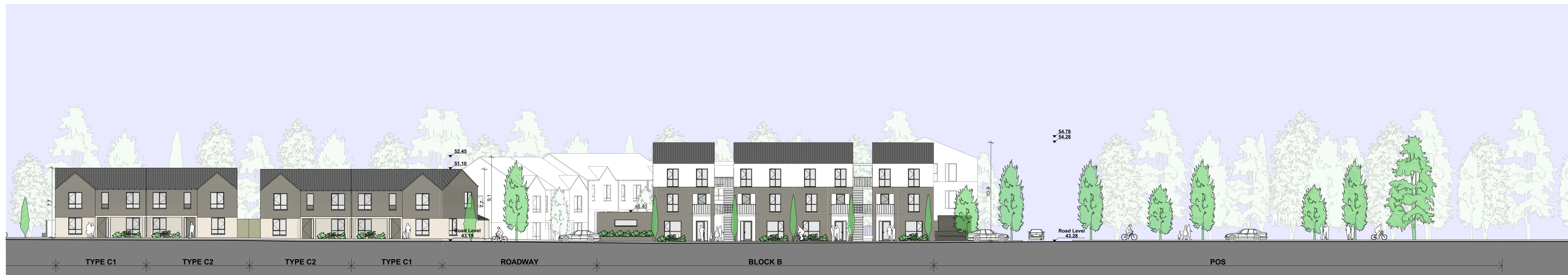
Site Section A-A (Continuation) SCALE 1:200