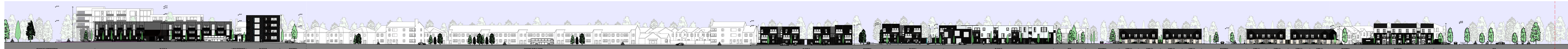
Site Section A-A (NTS) SCALE 1:707.54